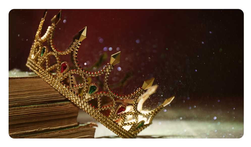
Fairy tales and nursery rhymes can help us find out about life in the past.