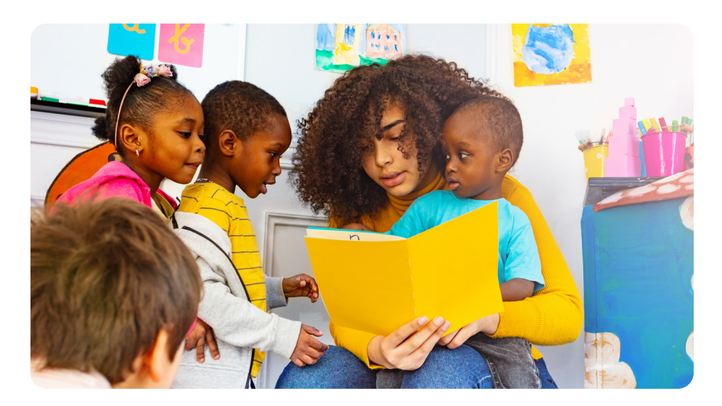
Fairy tales are traditional children's stories.

Read these interesting facts about stories and rhymes with a parent, carer or teacher.