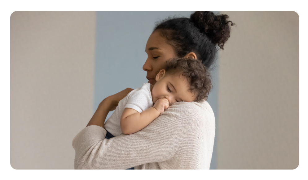
Lullabies are rhymes sung to children to help them sleep.